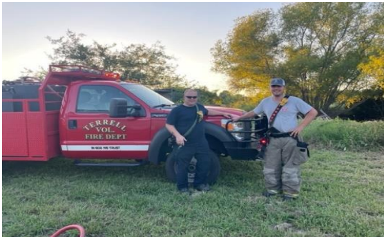
TVFD put out an unmanned barrel fire on September 19 th in back of a Poetry home on FM 986. It is against state law to leave a barrel fire unattended.