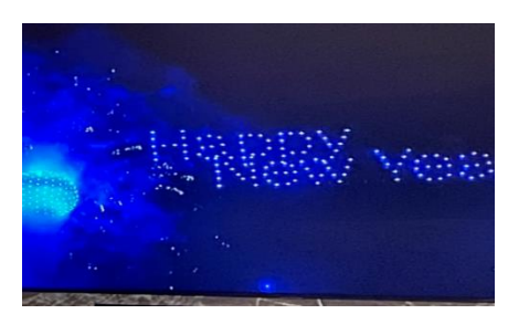
Drones spell out Happy New Year at Dallas Reunion Tower in 2023 New Year's Eve Celebration!