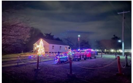
A decorated Train in front of Poetry Town Hall for the Lights Celebration December 18<sup>th</sup>.

<u>Got questions or concerns?</u> <u>Town Hall phone number is 469-902-7001.</u> <u>Email mayor.tara@poetrytexas.org</u>