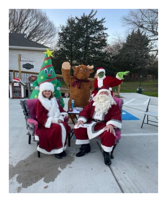
Fun characters showed up at Town Hall and gave out candy, cookies and ornaments.