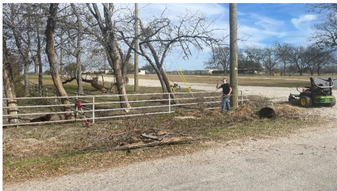
(Above) Longhorn Organics paid for painting of fence and trimming of trees and grass on the Town Hall leased property as a gift to the town.

**Keep Poetry Beautiful! Picking up litter regularly reduces the volume of litter!