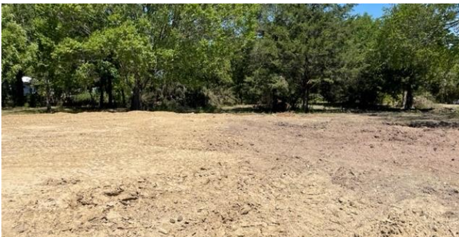
Site of New Home prepared for Poetry Town Hall complete with mature Pecan trees!