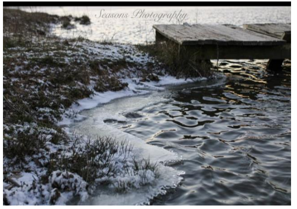
a local artist captured these photos during January 15<sup>th</sup> snow storm and subfreezing temperatures.