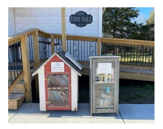
(above) A Lender's Library and a Giving Box of food for those in need are available at Town Hall 7 days per week.

Thursday, February 15th, Executive Meeting (closed) at 6 pm and Regular Meeting at Town Hall at 7pm. Sign up to speak at 6:45 pm or online. Town Hall is located at 5671 CR 323 Poetry, TX 75160. See Poetrytexas.org for more information.