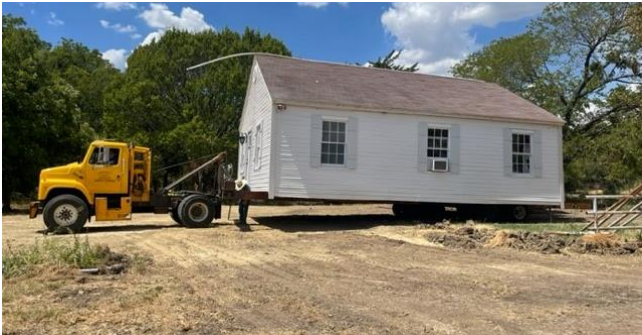
Northcutt Moving Service did a great job moving the renovated 60-year-old building!